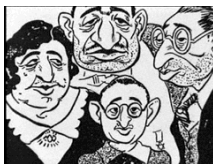
As the Jews disappeared from Germany, the circulation of the paper dropped, but it continued to publish until the end of the war.