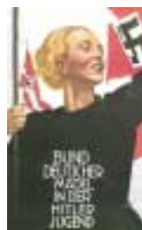
German Propaganda Poster for the Hitler Youth Organization