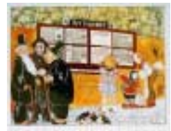
Like other Nazi propaganda its style was simple and repetitive.