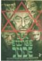
Poster From the Nazi Anti-Semitic Hate Film, The Eternal Jew