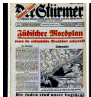
Der Stürmer Ritual Murder Issue, May 1, 1934